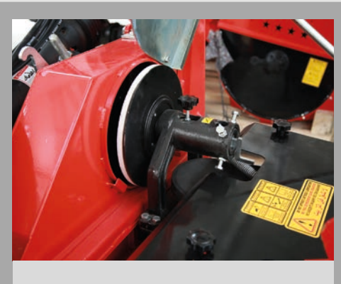
Easily Sharpening The Knifes