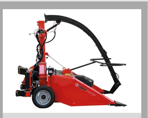
Easy Change to Transport Position