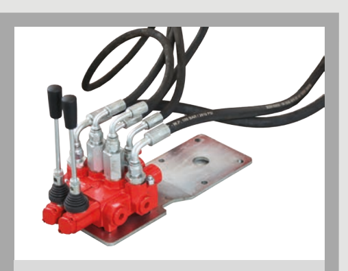
Hydraulic Control Valve