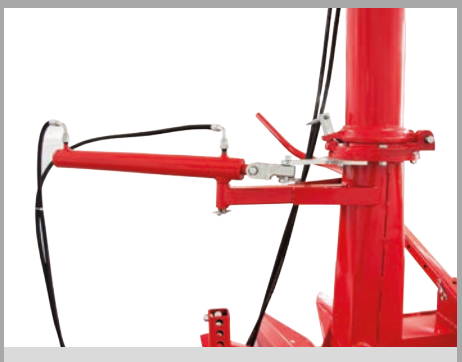
100° rotating chimney by hydraulic control valve