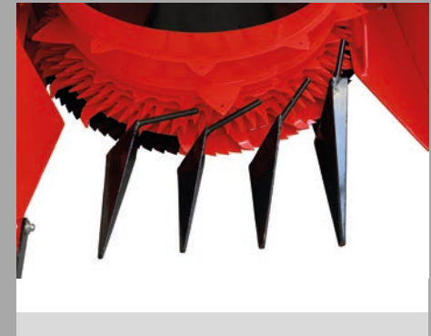
Row Independent Cutting Unit